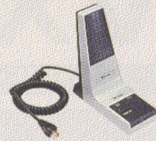
MD-11A&J Desktop Microphone