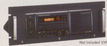
MR-3 EIA-standard 19-inch Rack