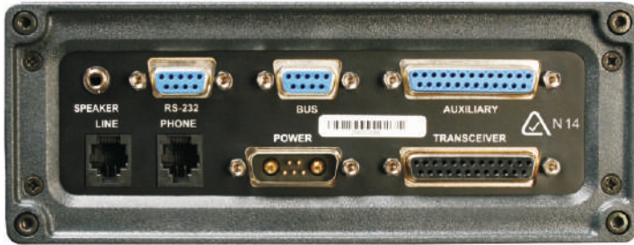
Barrett 2060 HF Telephone interconnect rear panel

98 pre-programmed telephone numbers stored in the 2060 can be accessed by HF manpacks, vehicles or base stations that only have Selcall and not the full dial Telcall option fitted.